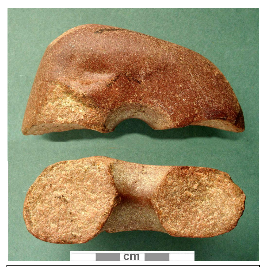
Photo 1. Photograph showing the Wimpole pebble-hammer.

During recent fieldwalking on National Trust land near the A603 Cambridge Road at Wimpole, the star find was an unusual stone artefact, shown in Photo 1.