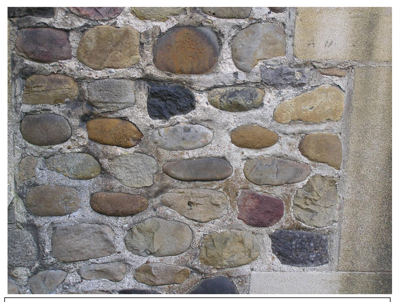
Photo 2. Photograph showing mixed cobbles of red quartzite, together with sandstone, flint, oolitic limestone, granite and gneiss ones, in the entrance wall to Little St Mary's Church, Cambridge (author's photograph but facts from Sedgwick Museum Walks booklet),

The pebble is composed of a reddish-brown quartzite material and was probably selected for its suitable shape. Numbers of such pebbles can still be found on the field today and they probably come from the boulder clay deposits left behind in West Cambridgeshire after the last Ice Age, hence their well-rounded shape. It is thought that they originated in Scotland. They occur here in Cambridgeshire in sufficient numbers, along with other glacial erratics, to be used as part of a common building material used on church walls when set in mortar (as shown in the photograph 2).